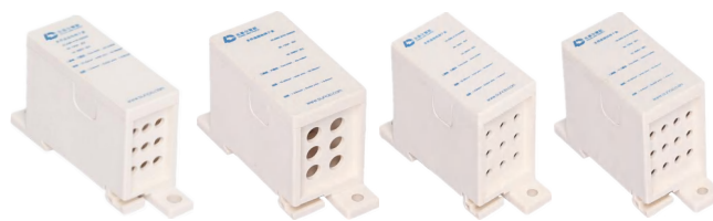
S0109 一进九出 S0206 两进六出 S0209 两进九出 S0212 两进十二出